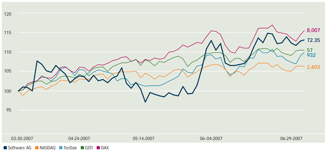
SHARE PRICE DEVELOPMENT (INDEXED)