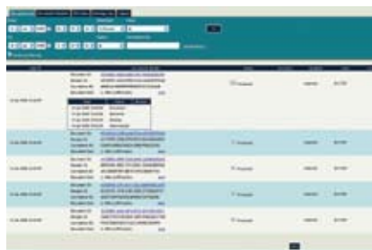
Improved manageability and usability is standard in DIS 2.0