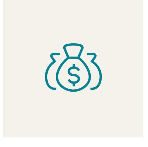
Reduced IT OpEx