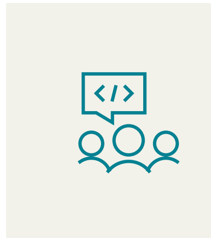
Faster business innovation