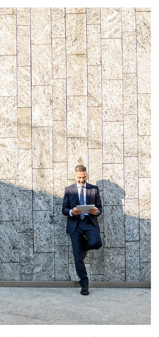
Manage your application portfolio smartly to ensure applications are on target with business needs.